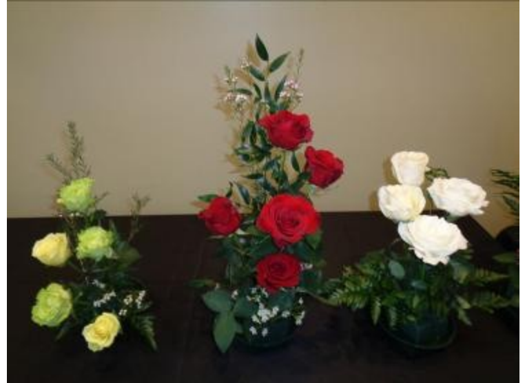
Arrangements from the arrangement workshop were used as table decorations for the banquet.