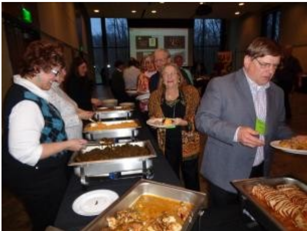
The banquet was a catered buffet.